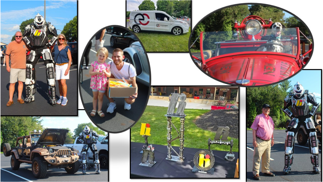
Car Show at High Companies, with custom trophies